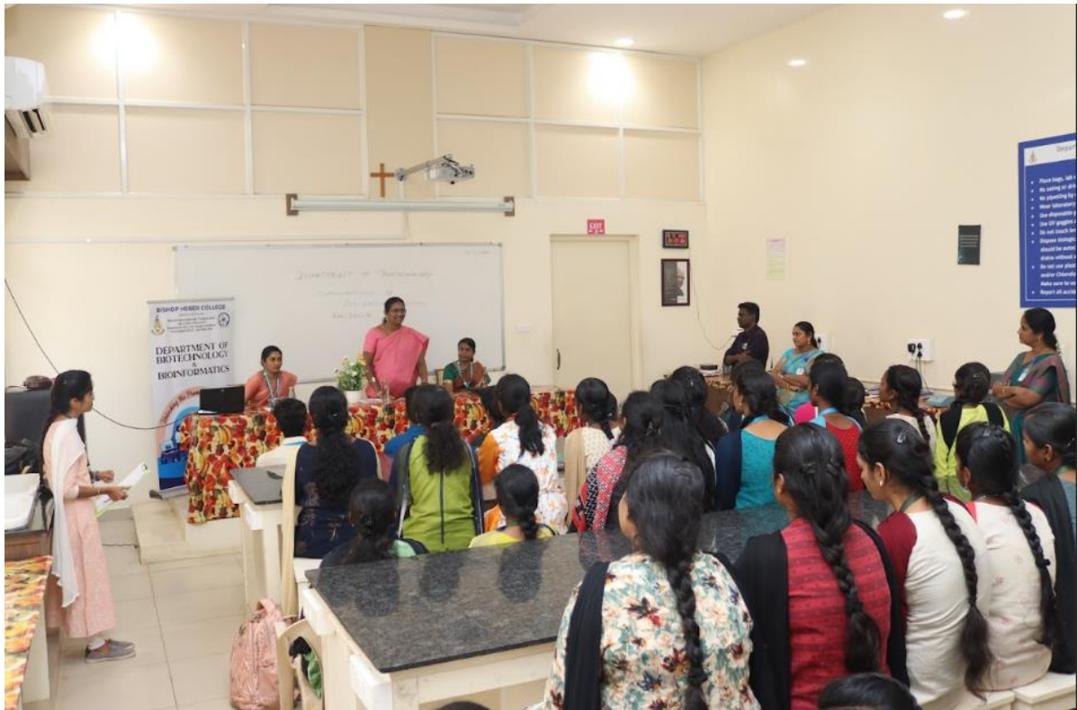
WORKSHOP FOR II AND III B.Sc. BIOTECHNOLOGY